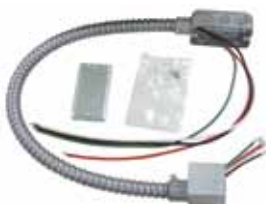
Hardwire Kit AYHW101