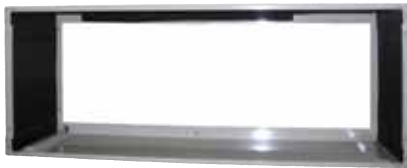
42" Wall Sleeve AYSVB01A