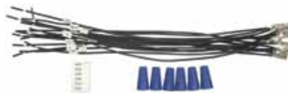
EMS/Front Desk Control Connection Kit AYFD101

For technical support & quality issue, please call 215-795-2225