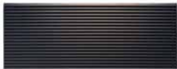
Architecture Grille - Dark Bronze AYAGALB01A