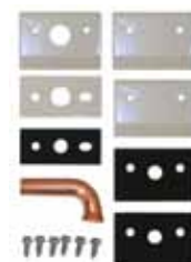
Condensate Drain Kit AYDR101