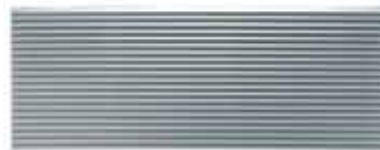
Architecture Grille - Soft Dove AYAGALC01A