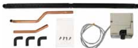
Condensate Disposal Kit AYCD2101