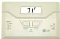
Digital Wired Wall Thermostat PYRCUA0A

For technical support & quality issue, please call 215-795-2225