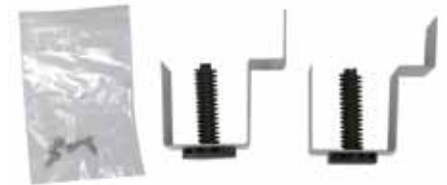
Leveling Legs AYLL101