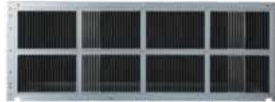
42" Stamped Aluminum Grille AYRGALA01