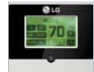
Wireless Environmental Control Manager (ECM) with Occupancy Sensor PYRCUCC1HA For technical support & quality issue, please call 541-344-4448, press #2